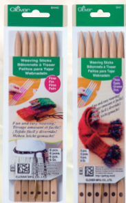
Art No. 8440- Weaving Sticks (Fine) Art No. 8441- Weaving Sticks (Thick)