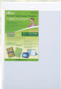
Art 9571- Tablet Keeper Shapers (For base)

White Fabric cut into 1/2" strips- approximately 1/2 yard